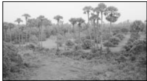
Before irrigation system

A word from the author: I have never seen a greater cause to invest in as the one I have witnessed at COTR/CFI ministry. Blessings continue to flow as we continue to partner financially and through prayers. Thanks be to God and the Titus family, for your blessings to our family and the Ministry.