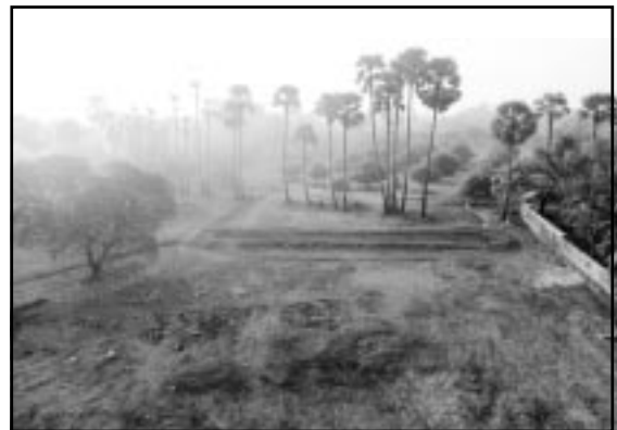
After completion of irrigation system